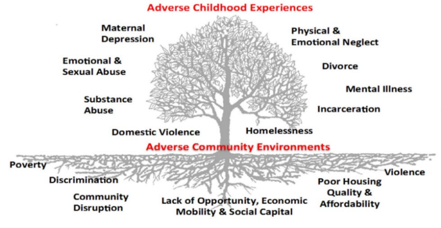
Figure Four: The Pair of ACEs model by Ellis, W., Dietz, W.H., Chen, K.D. (2022). Community Resilience: A Dynamic Model for Public Health 3.0. Journal of Public Health Management and Practice.